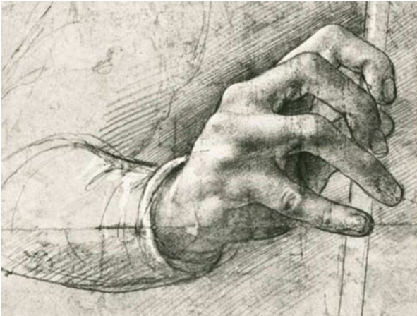
Leonardo da Vinci

In 2 minutes, students will make as many different marks as possible on a piece of paper with the tools that they are given. Afterwards, students will walk around the room to look at everyone's drawings.