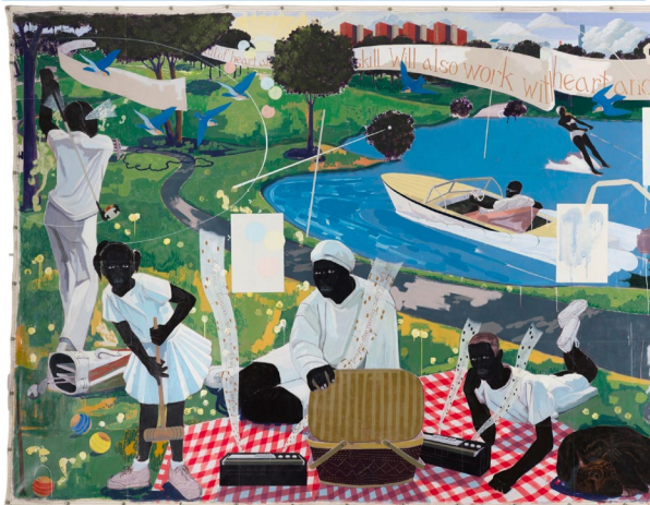
Kerry James Marshall

Students will imagine an encounter with their favorite fictional character. Then, they may choose to share it with a partner, or write a short paragraph about it.