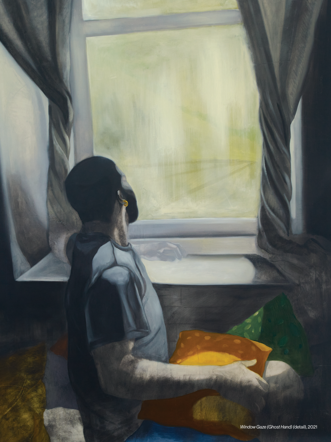
Window Gaze (Ghost Hand) (detail), 2021