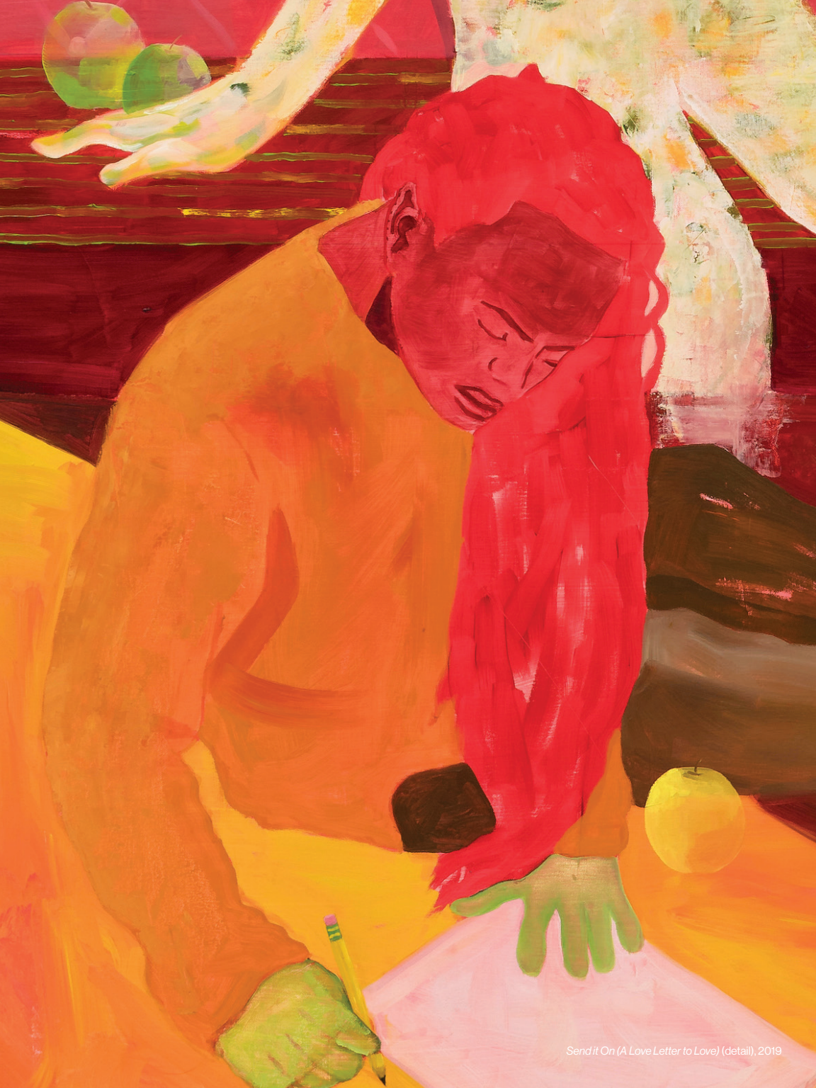
Send It On (A Love Letter to Love) (detail), 2019