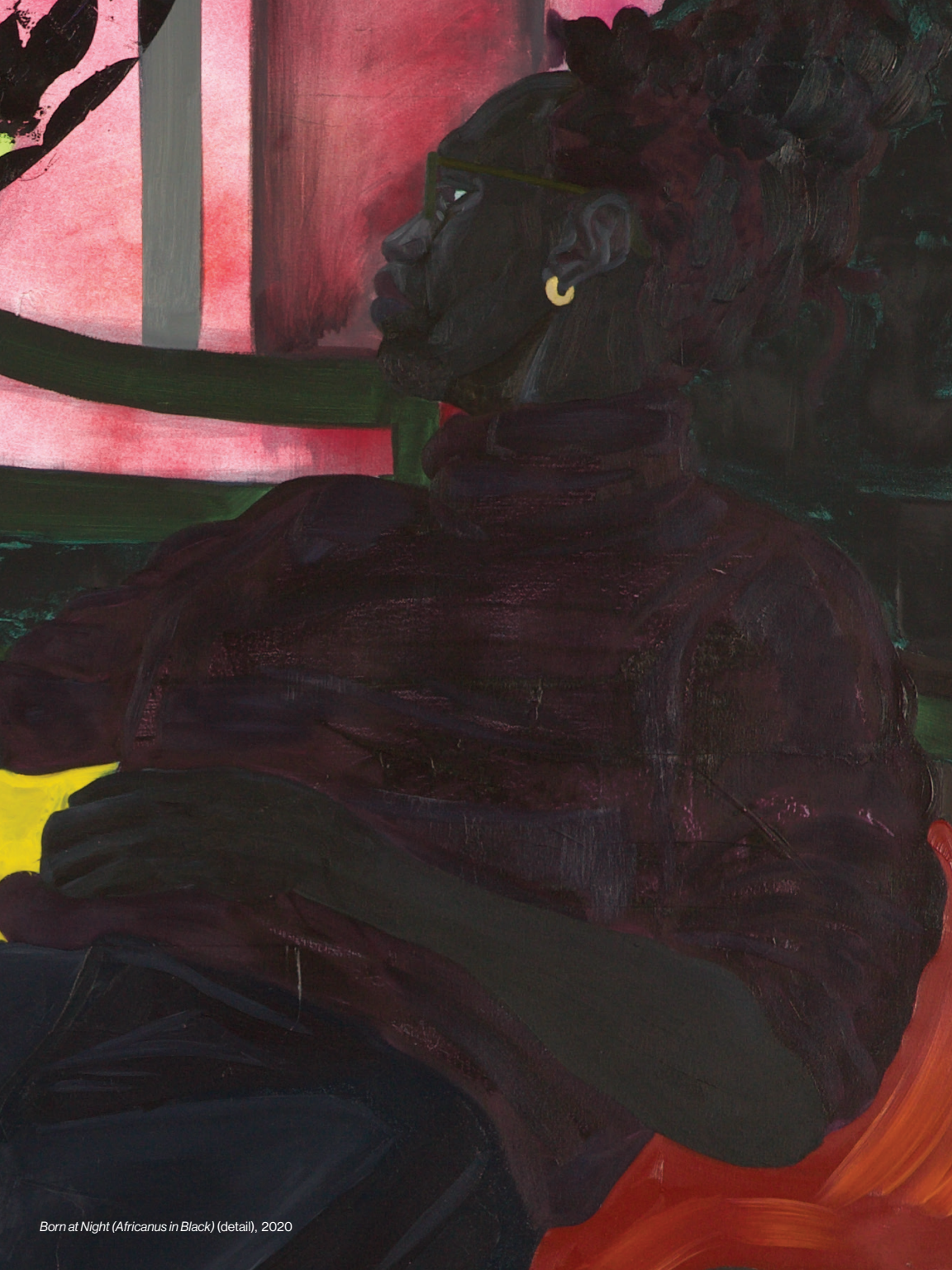
Born at Night (Africanus in Black) (detail), 2020