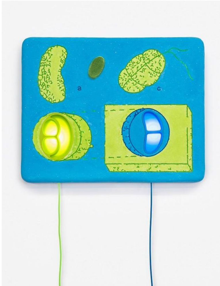
Danni O'Brien, Homemade Barriers , 2022

gathering and synthesizing of information, and sometimes, misinformation, leads to sites for confusion and conspiracy. I became interested in comparing the piecing together bits of decontextualized information to the assemblage style practice I employ in my work. The forced reunion of once informative diagrams, stripped of their context and therefore educational capacity, with plastic tokens of the domestic landscape, similarly stripped of their typical function, create microcosms for the clashing evident in our current socio political landscape.