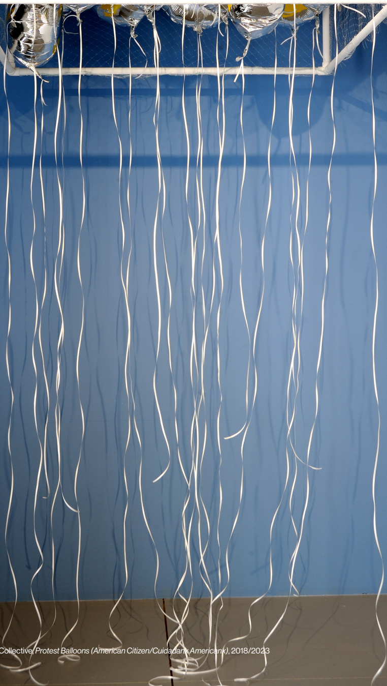
Cog-nate Collective, Protest Balloons (American Citizen/Ciudadano Americano) , 2018/2023