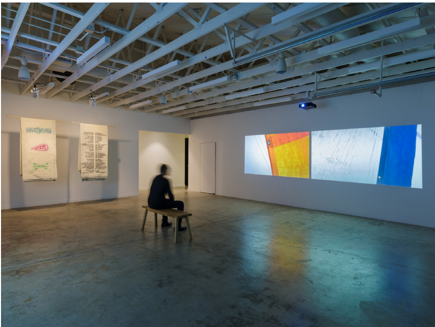
Installation views at ICA San Diego featuring Cognate Collective, En todas partes y en ninguna a la vez... [Everywhere and nowhere at once], 2021-2022